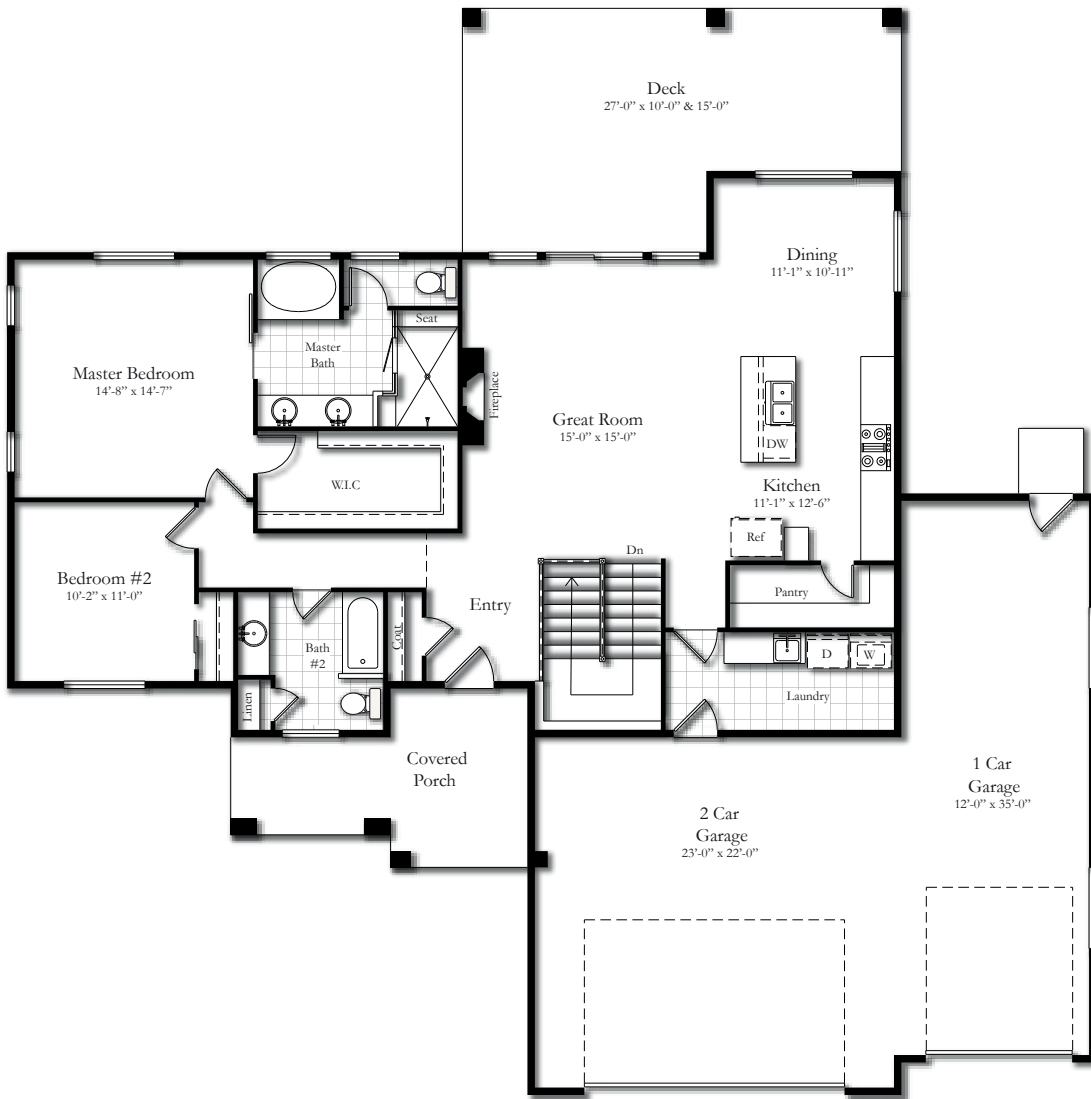
Upper Level 1,634 Sq. Ft.